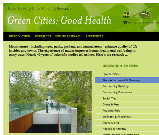
1,706 articles :: distribution by benefits theme