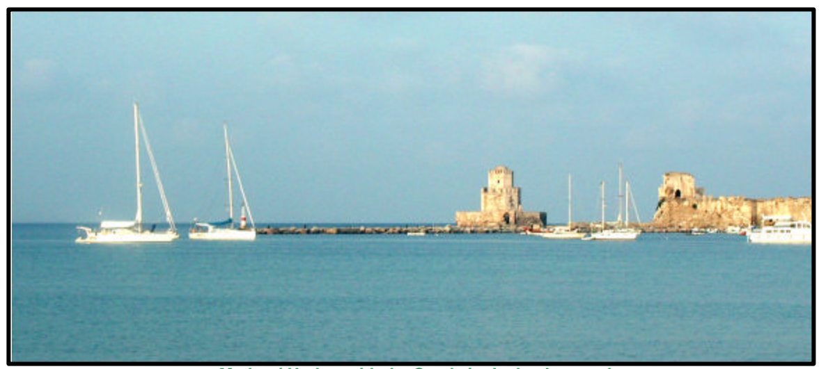
Methoni Harbor with the Castle in the background

Methoni will be the site for the NOA high-resolution, polarimetric X-band radar. It will be located on a backroad on the ridge above the town. From this location, near the weather station, the radar will have a clear view to the ARG mooring location in the Ionian Sea to the west, and an equally clear view towards the DRG network at Finikounda to the east.