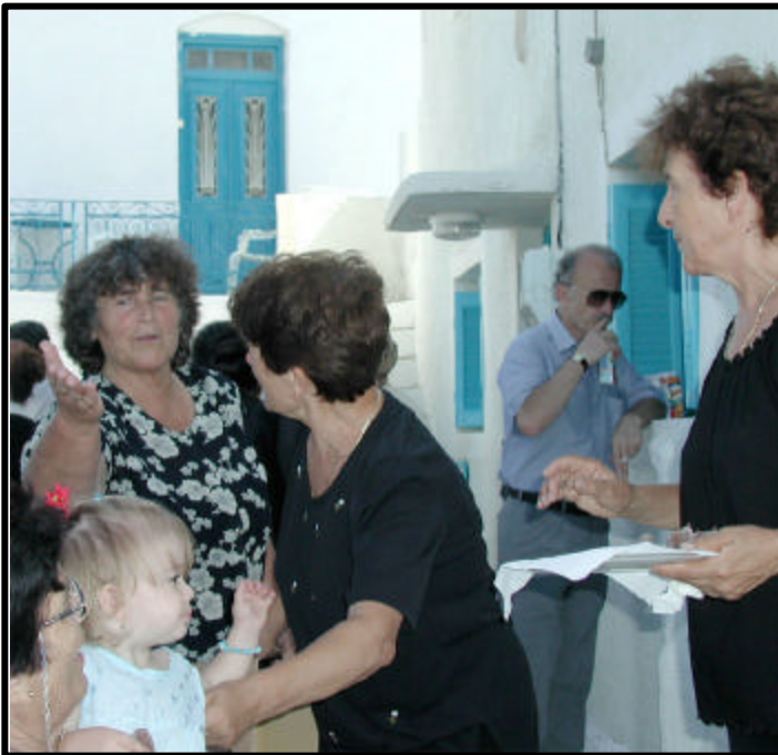
A wake on the street in Kastro Refreshments were offered to all in attendance.