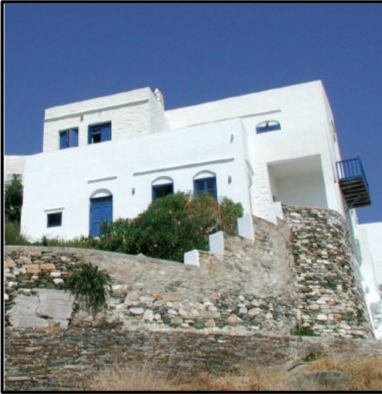
A building overlooking the Aegean Sea in Kastro

I asked Manos about the preference for blue building trim. He said the blue color matches the color of the sky and the sea. There are building codes for paint color – white or “natural” stone with blue or green trim. White with blue dominated. The buildings are mostly stone with some wooden beams to support the ceilings.