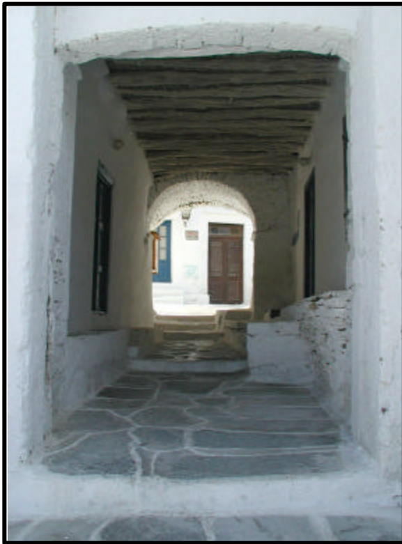
A covered walkway in Kastro. Wooden beams are used to hold up the ceilings.