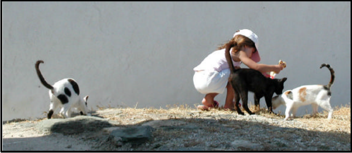
Feeding cats in Kastro