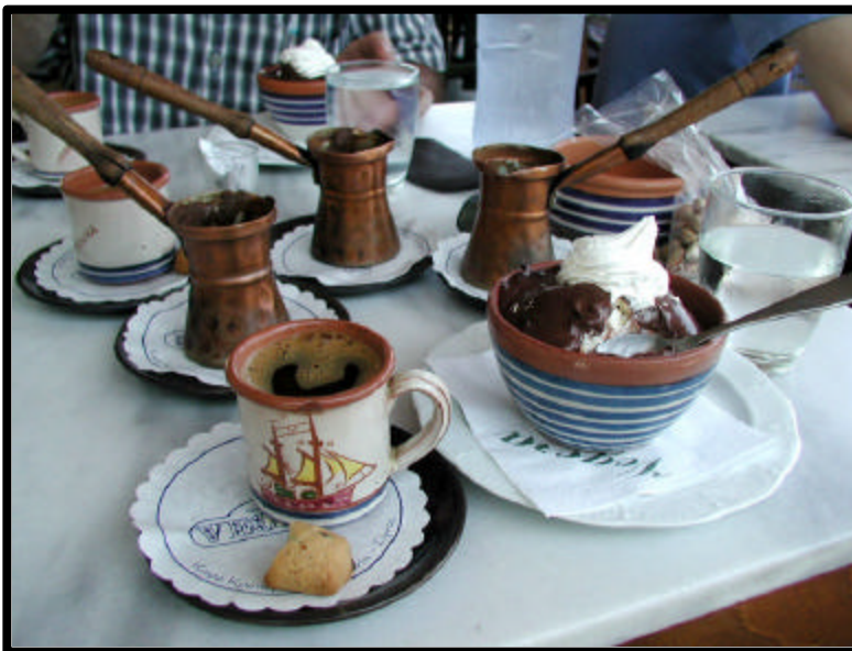
Greek coffee in Apollonia. The coffee is brewed in individual "pots" and served "thick".

After spending a couple of hours exploring Kastro, I took the bus back to Apollonia and called Manos. Sveta, Nikos and he met me for coffee. Actually, Nikos was only allowed to drink water.