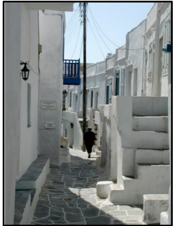
Street scene in Kastro Cars have to park at edge of town.