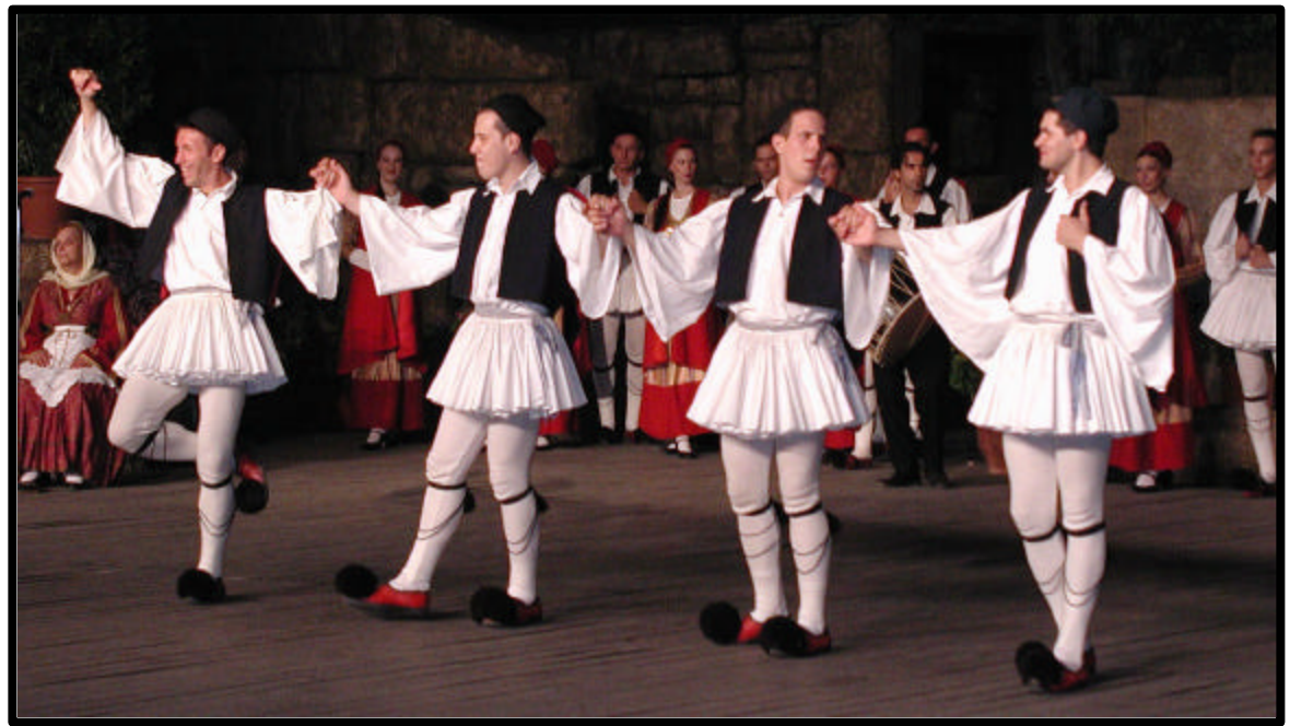
Dancers from "Dora Stratou" welcome us to Greece