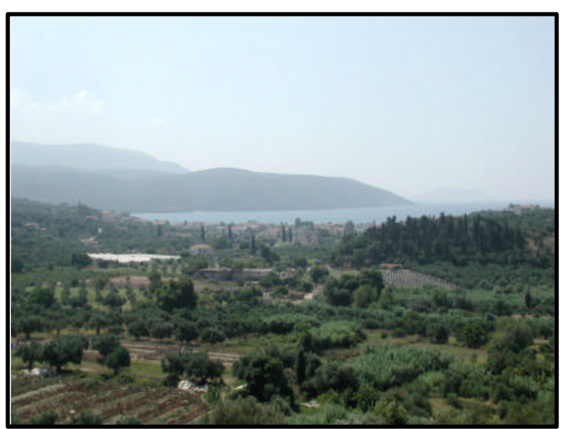
Finikounda will be the site of the Dense Rain Gauge network.