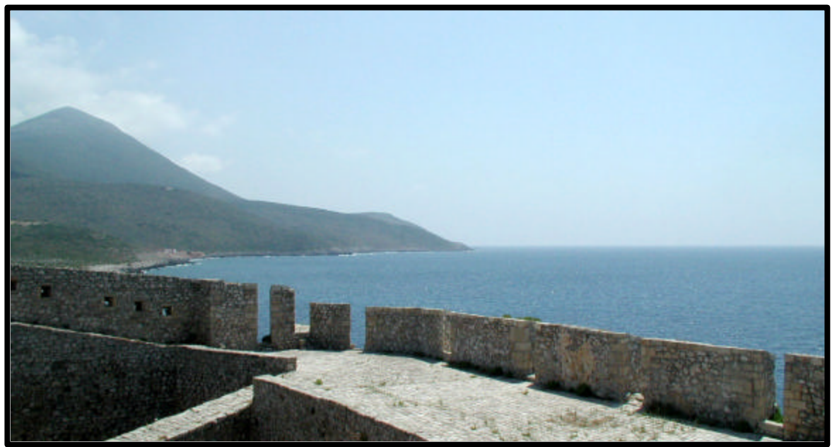
Southwest of Pylos, Messinia the Ionian Sea is over 3 km deep within 20 km of shore