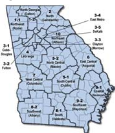
Figure 1: GA Public Health Districts

For influenza surveillance in the West Central Health District (WCHD), hospitals report to SendSS the total number of rapid influenza tests performed and the number of positive tests by influenza type. The infection control practitioner (ICP) at Hospital A in WCHD conducts employee absenteeism surveillance, including a voluntary reporting mechanism that collects information on the reason for absence.