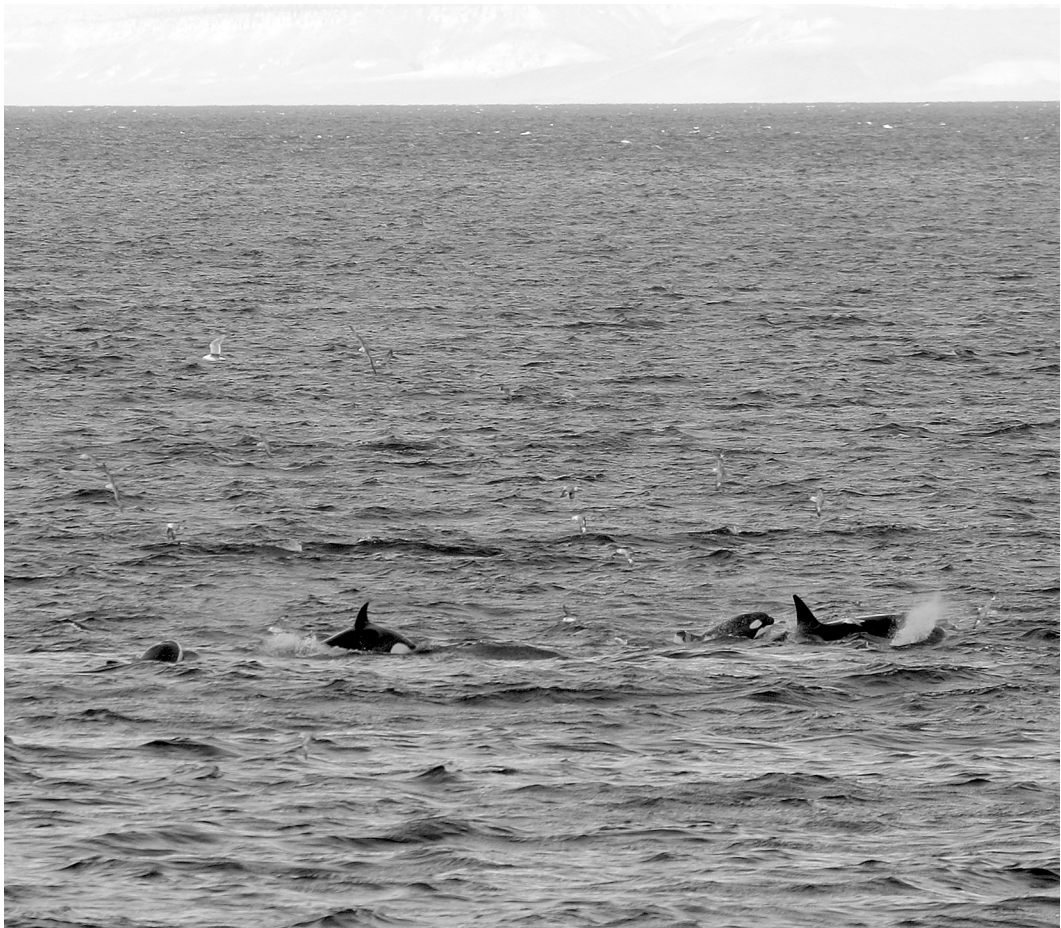
FIGURE 1. Oil film on the surface created by Killer Whales feeding on Narwhals in Admiralty Inlet, Canada, August 2005. Large aggregations of Fulmars appeared in the area shortly after each kill.

The standard deviation of average daily positions indicated that dispersal of Narwhal groups varied approximately 19.9 km north-south, and 13 km west-east before Killer Whales arrived (Table 2). The core of the pre-attack kernel home range (50% probability area) was concentrated just offshore of Kakiak Point and distributed along the west coast of the inlet encompassing 347 km 2 (Table 2).