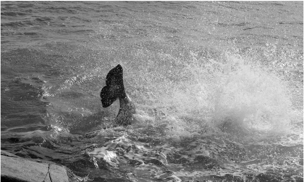
FIGURE 3. During the Killer Whale attack, Narwhals beached themselves in sandy areas and made tail slaps. Coastline can be seen in lower left.

Satellite telemetry data indicated instrumented Narwhals clearly responded to the presence of Killer Whales (Figure 4). During the attack, both the north-