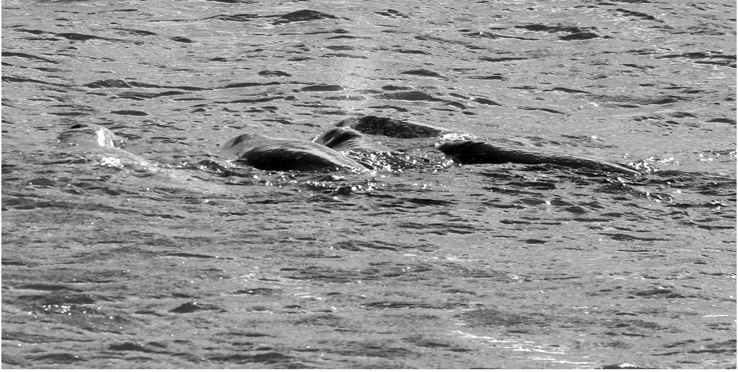
FIGURE 2. When Killer Whales arrived in the vicinity of Kakiak Point, Narwhals formed tight groups and remained close to the shore lying still.

On 20 August, Killer Whales were visually observed arriving at Kakiak Point traveling a northbound route along the west side of the inlet. Narwhals were already present in the coastal area ( <500 m from the shore) around Kakiak Point and in a small bay just behind the point. When the Killer Whales were within 2–4 km, Narwhals suddenly moved closer to the shore in shallow water ( <2 m). Some Narwhals formed tight groups