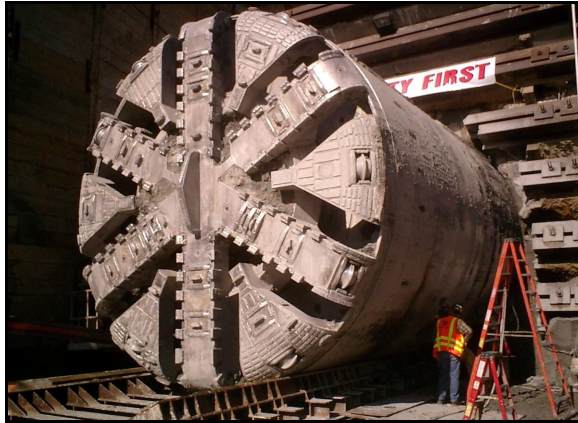
Figure 4. Face of a TBM (Tunnel Boring Machine) similar to that used on the Brightwater West project. (Ref 11).

where they are dumped into small rail cars that carry the materials to the open end of the tunnel. Pressure in the machine room is the same as that of the face, but behind the machine room pressure is essentially atmospheric. The face is rotated and pushed along, digging several metres per day depending on the terrain. This is a Pressure Balanced Shield Machine. In another type of TBM the excavated soil is mixed with a high-density slurry which is pumped out through pipes. Both types are involved at Brightwater.